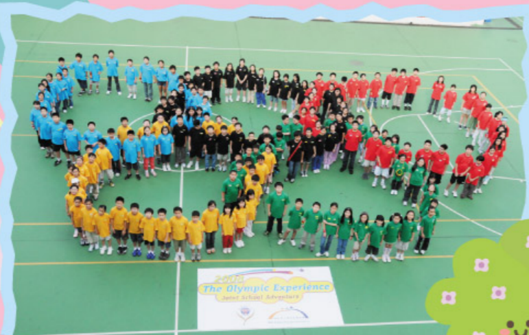
Joint School Activities 2008