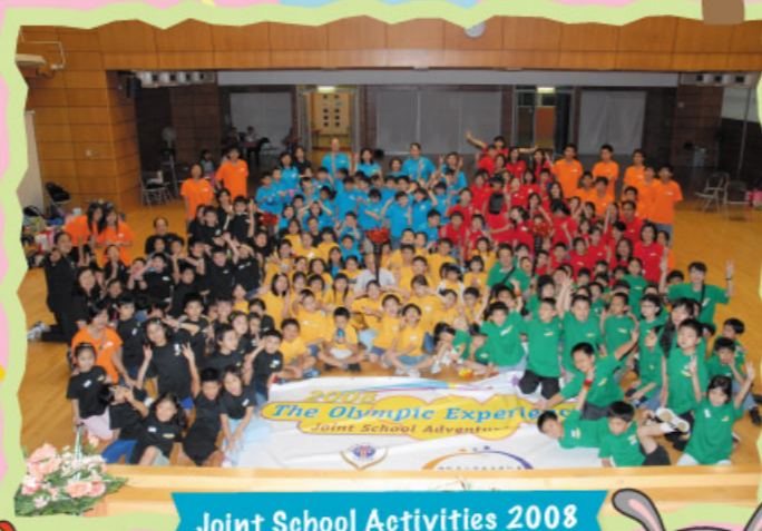
Joint School Activities 2008