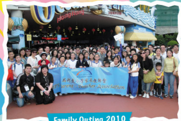
Family Outing 2010