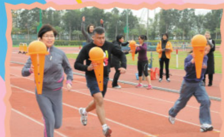
MPS Sports Day 2012