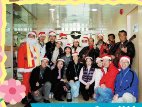
MPS Christmas Party 2003