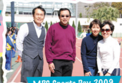
MPS Sports Day 2009