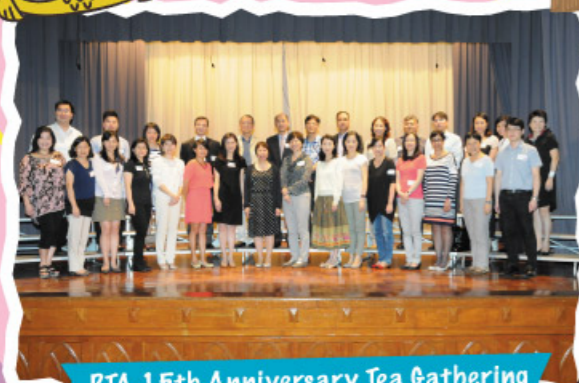
PTA 15th Anniversary Tea Gathering