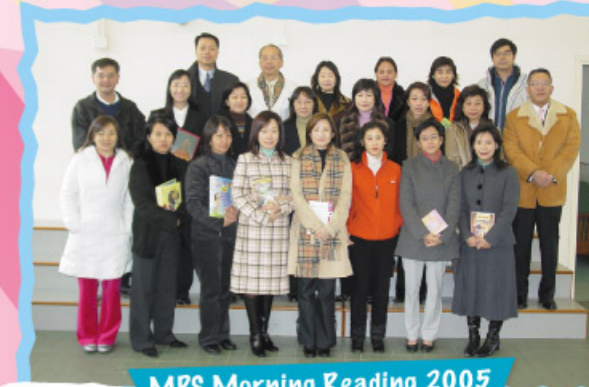
MPS Morning Reading 2005