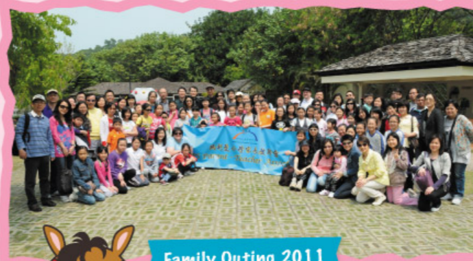
Family Outing 2011

MPS-PTA was a baby born in 1998. Members comprised of Parents, School Staff and Students. Every single member is important and need to cooperate with each other to enable smooth operation and success.