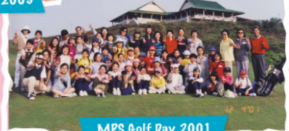
MPS Golf Day 2001