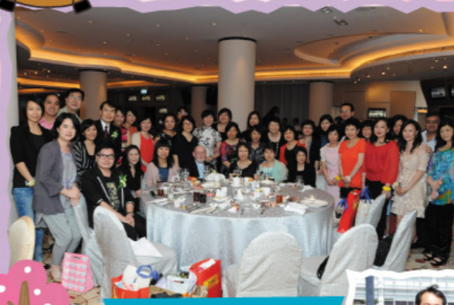
Graduation Dinner 2012

Above story taken from Assembly performance of MPS Students in the 00's based on https://www.reddit.com/r/Jokes/comments/26kidi/all_the_organs_of_the_body_were_having_a_meeting/?st=ji6nwjk3&sh=f74414f9