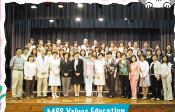
MPS Values Education Workshop 2006